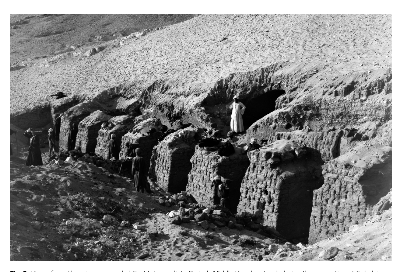
Fig. 3: View of an otherwise unrecorded First Intermediate Period–Middle Kingdom tomb during the excavation at Gebelein, probably in 1914. Archivio Museo Egizio, E0612.

In spite of the lack of information accompanying the photographs, I could indeed identify the two objects they depict in the Italian archaeologists' notes. Spe-