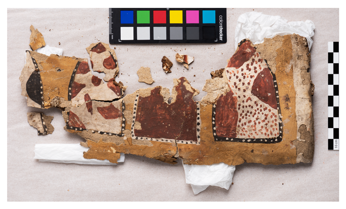
Fig. 4: The fragmentary model of the cabin today. Museo Egizio, S. 15776 (?).

documentation is available for the granary model. As to the cabin model, I managed to track it down in the database of the Museo Egizio, under number S. 15776 (?), <sup>14</sup> where it is described in the following terms: "Model of a vessel: fragments of the canopy on the deck, with shields made of bovine hide resting against it." 15 No further information is given. The small and fragile fragments of this object currently preserved in the museum storage clearly belong to the model shown in C0629-C0630. At the moment, only the left side of the cabin survives, with only four of the original five shields, for an overall length of 30 cm. Hopefully more fragments may turn up in the museum's storage (Fig. 4). We can now estimate that the entire cabin was about 50 cm long and, hence, that the complete boat was presumably more than one meter long (Fig. 5). The colors are still vivid. Red, white and black are used for the shields, ochre for the cabin walls. Some remnants of the white part of the cabin survive on the bow-ward side.