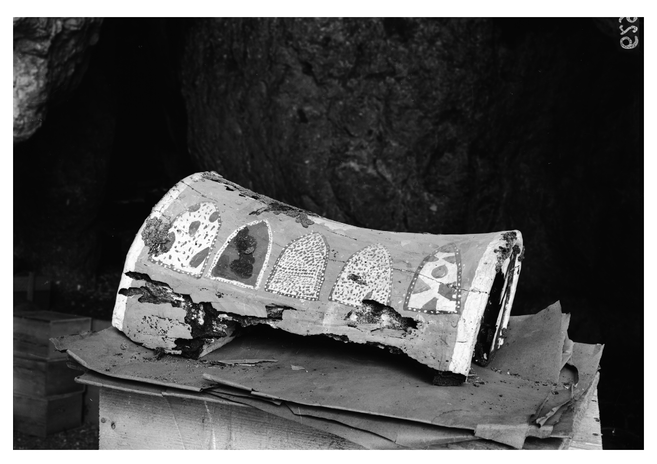
Fig. 6: The other side of the cabin model, photographed at the campsite. Archivio Museo Egizio, C0629.