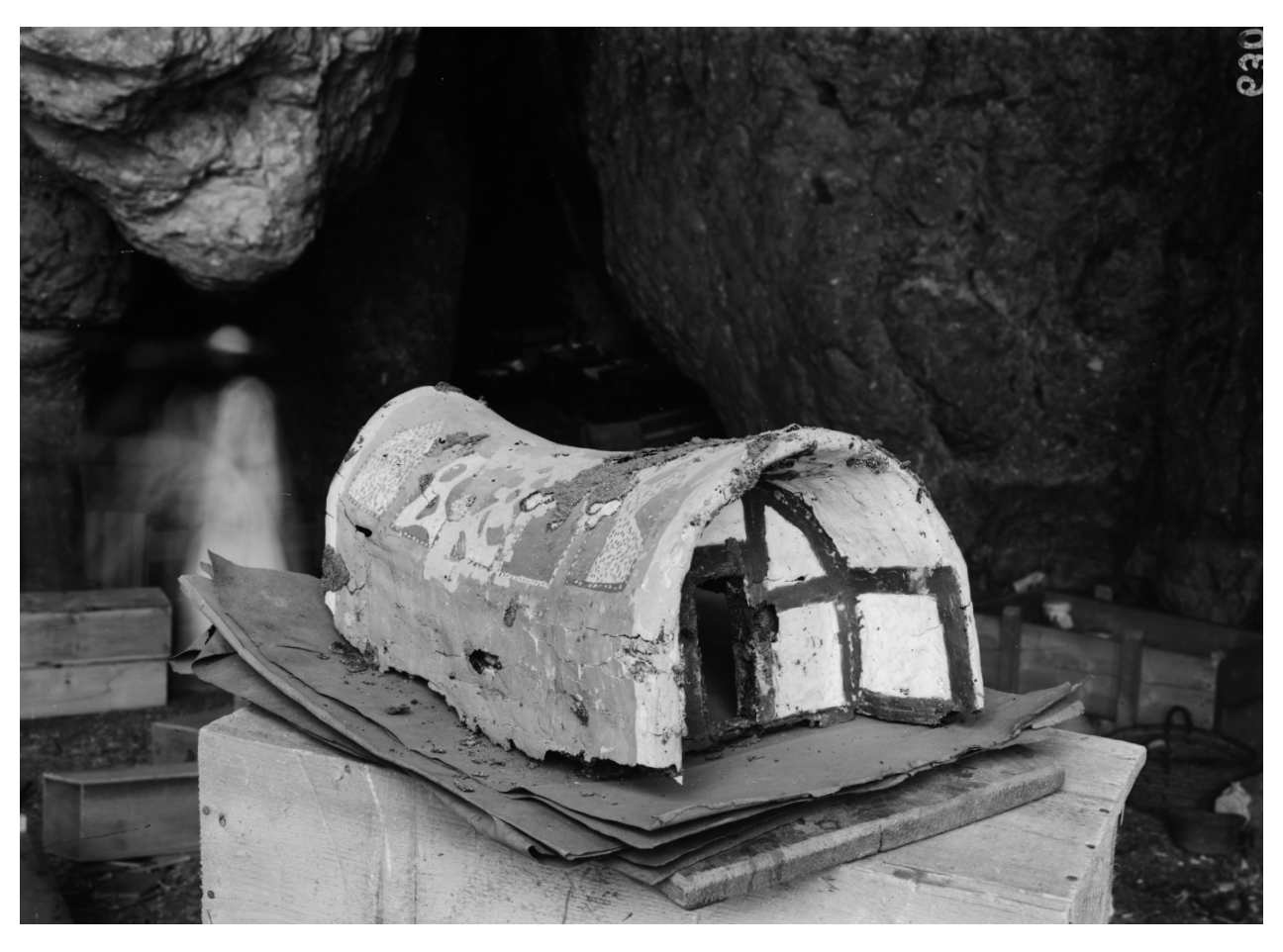
Fig. 1: Fragmentary model of a cabin, photographed at the campsite.