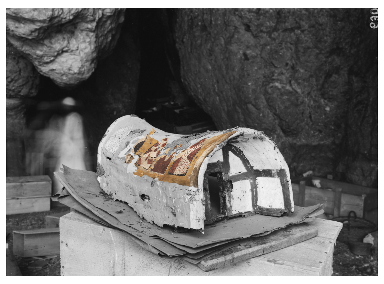
Fig. 5: The cabin fragments modeled onto the historical photo. Museo Egizio, Nicola Dell'Aquila and Alice Salvador.