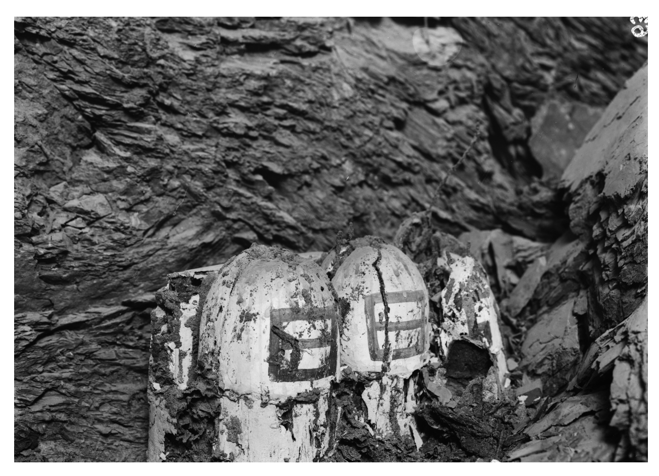
Fig. 2: Fragmentary model of a granary, photographed inside the tomb. Archivio Museo Egizio, C0631.