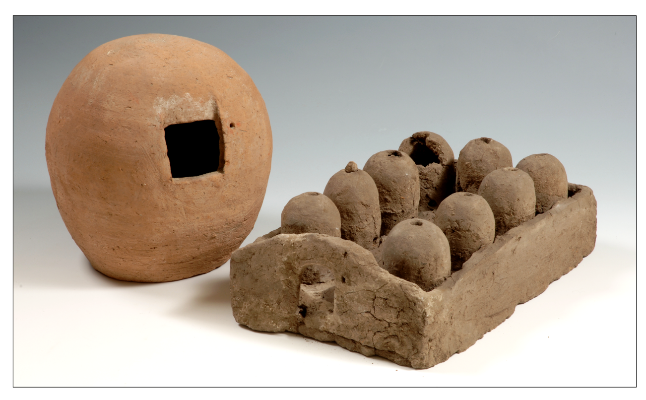
Fig. 9: Clay models of granaries, from Gebelein, 1910 and 1914 excavations. Museo Egizio, S. 11960, S. 15802.

several coffins discovered at Asyut and Deir el-Bersha. An early example, different in colors but similar in shape, can be recognized in a tomb painting of the nomarch Pepyankh-herib, lord of Meir in the time of