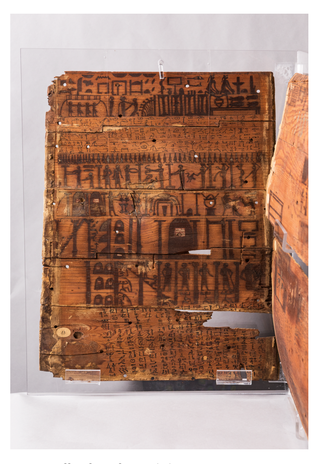
Fig. 10: Coffin of Iqer, from Gebelein, 1914 excavation. Museo Egizio, S. 15744.

very little about Iqer, except for the archaeologists' descriptions mentioned above. So far, the only dating elements in the assemblage are the astronomic calendar and the Coffin Text spells on his coffin,80 found by the Missione Archeologica Italiana and now partly held by the Museo Egizio (in a very ruined state, as previously noted).81 In addition to the coffin (S. 15744/01),82 Iqer's burial assemblage includes a ladder-shaped support for the mummy (S. 15744/02), a model spear and a model boomerang (both inventoried under S. 15744/03).83 The tomb is still far from having an accepted specific date. Some scholars date the coffin to the second half of the Twelfth Dynasty,<sup>84</sup> others prefer to date it between the late Eleventh Dynasty and the early Twelfth Dynasty.85 The two models, and especially the boat cabin, can help us dispel this uncertainty: their affinity with Meketre's models and the paintings from the tomb of Iti is an argument in favor of the earlier date for the coffin, and for Iqer himself. A date in the second half of the Twelfth Dynasty could only be upheld if we admitted that the models are instances of the lingering of an old style in the provincial site of Gebelein, as Leospo and other scholars have argued