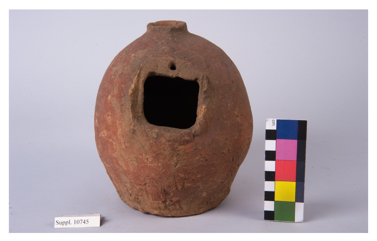
Fig. 8: Baked-clay model of a granary, from Asyut, 1910 excavation. Museo Egizio, S. 10745.